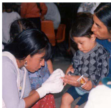
HemoCue anemia screening in Mexico -Un Kilo de Ayuda