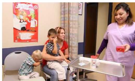
HemoCue supports women, infants and children (WIC) clinics in the United States in their efforts to screen and monitor anemia.