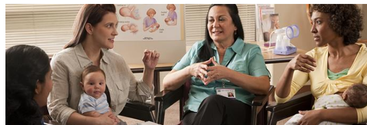
HemoCue is actively supporting Ministry of Health "Mother and Child" initiative in Malaysia