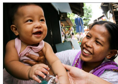
HemoCue anemia screening initiative "Women and Infants" in Indonesia