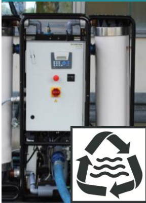
Water Supply Systems