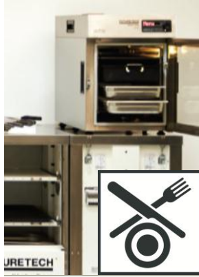
Mobile Catering Systems