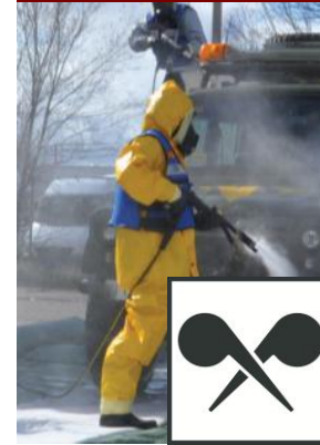
CBRN Protection Systems